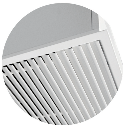
Detail of exposed inlet grille