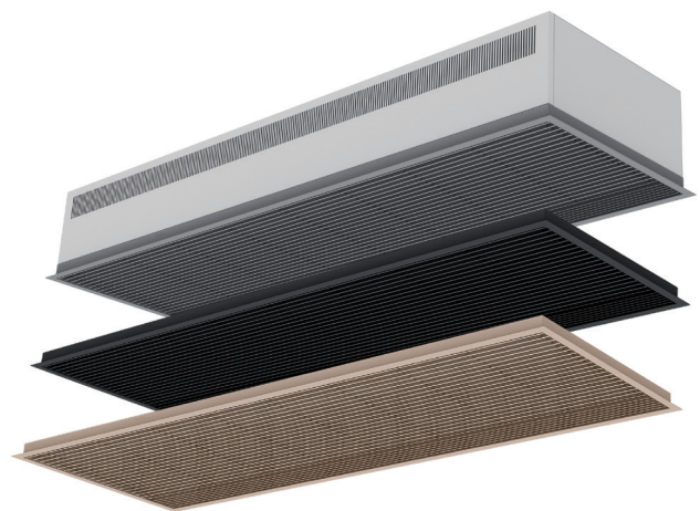
Customizable inlet grille in RAL color optionally